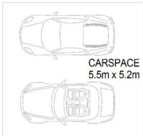
UNDER GROUND LEVEL