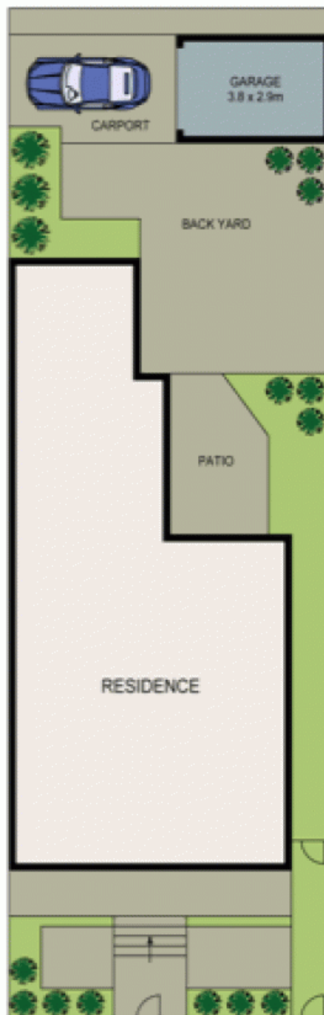
SITE PLAN- NOT TO SCALE